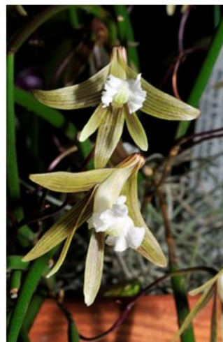
Dockrillia striolata 'Ruffles'