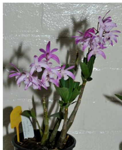
Dendrobium Dainty Gem