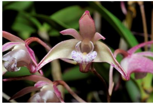
Dendrobium Ellen Lorna