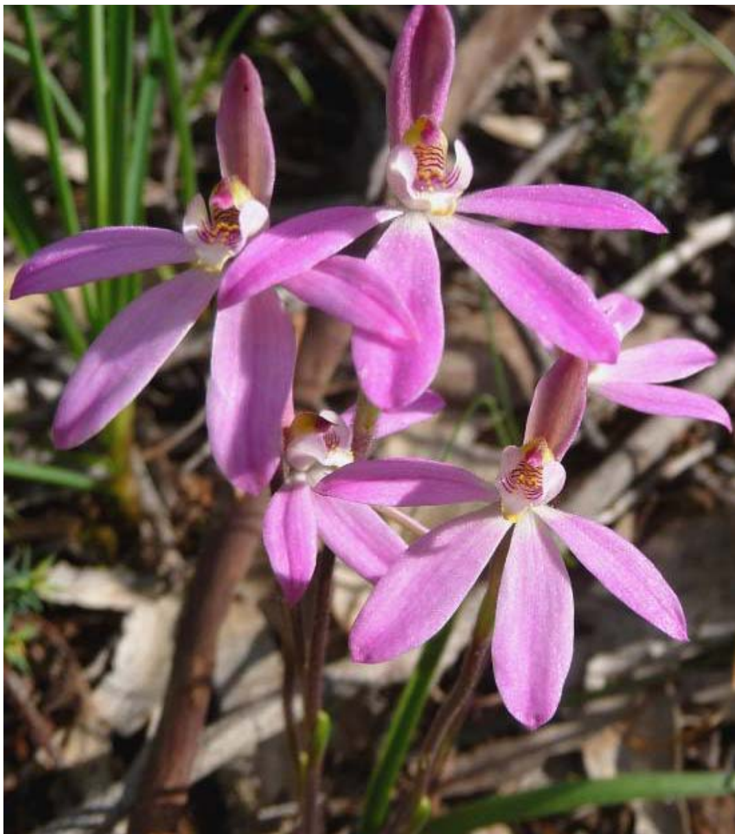
Barb Bayley, Petalochilus coactilis , the Spaniards Block

There were many species not yet in flower including fifteen sun orchids and six Microtis spp, some of them not named.