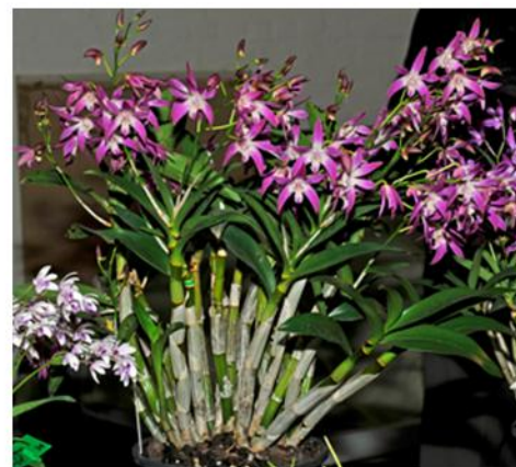
Dendrobium Annes Rainbow Surprise