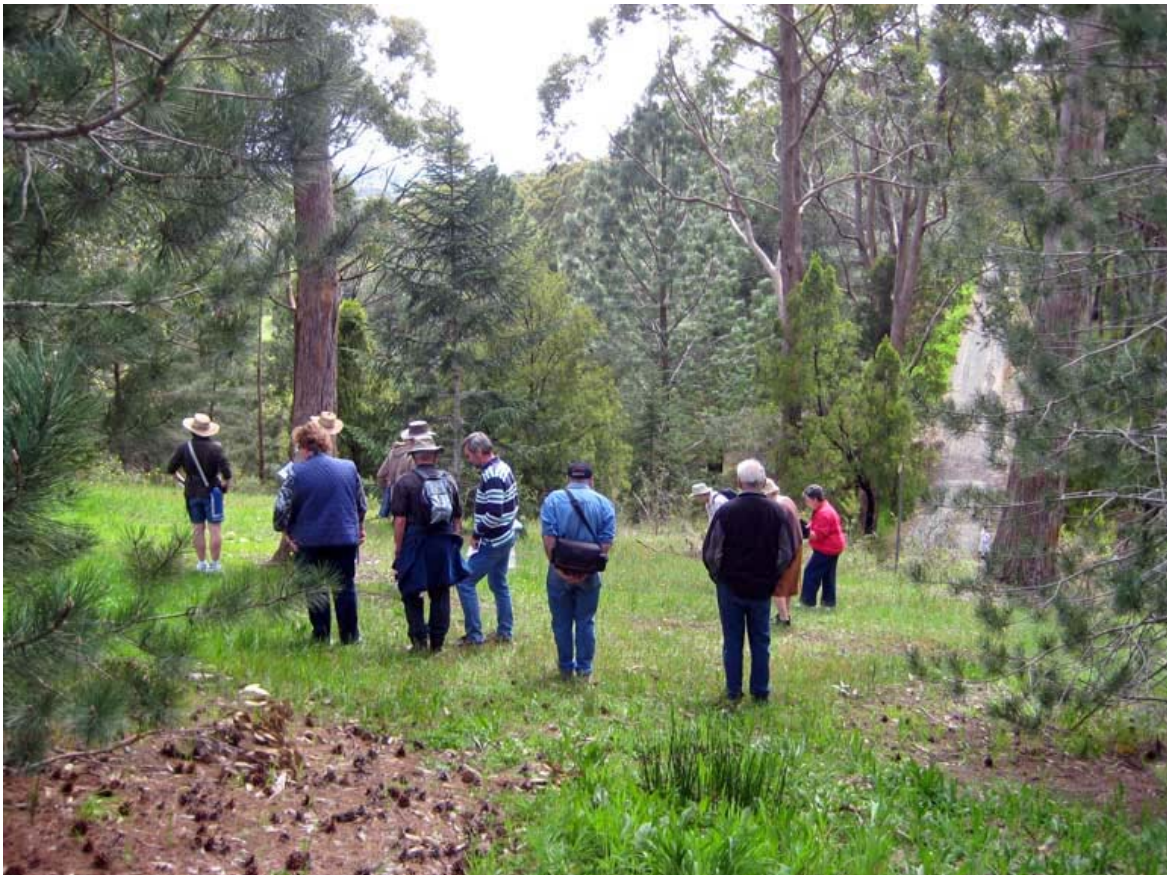
Looking at Orchids in grassland of The Mt Lofty Botanic Gardens

For those who keep up with these things you will note that this argument has been had before but this time it is final and no correspondence will be entered into!