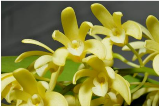
Dendrobium x gracilicaule