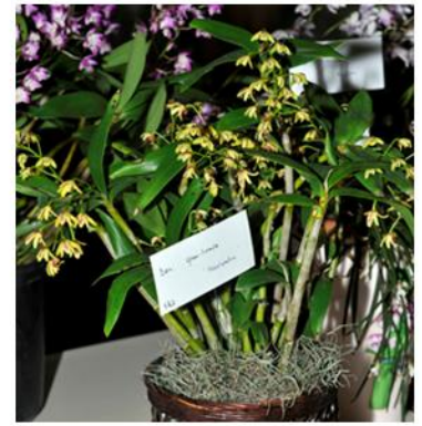
Dendrobium x gracillimum