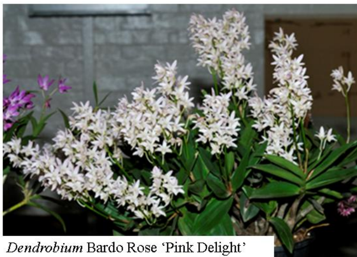
Dendrobium Bardo Rose 'Pink Delight'