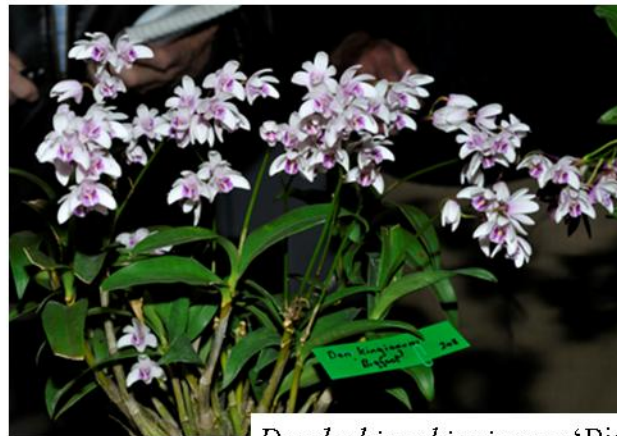
Dendrobium kingianum 'Bigfoot'