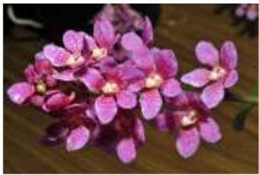
Sarc Zoe 'Crimson' x Fizzy Dove x Rosella