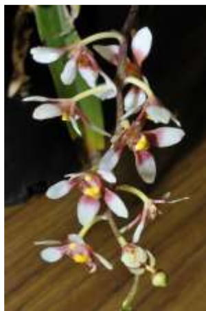
Sarc Cream Cake x fitzgeraldii

I would like to see more of these people acknowledged, knowing that they do not do it for the recognition. They are passionate about orchids and their conservation and doing what they love. Amongst the people I know, it is the volunteers who live the most rewarding lives and have the greatest experiences.