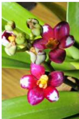
Sarc Fitzhart x Velvet Chocolate