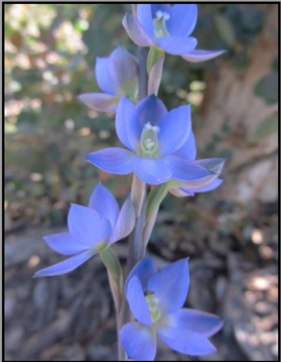
Thelymitra grandiflora ssp. exposa