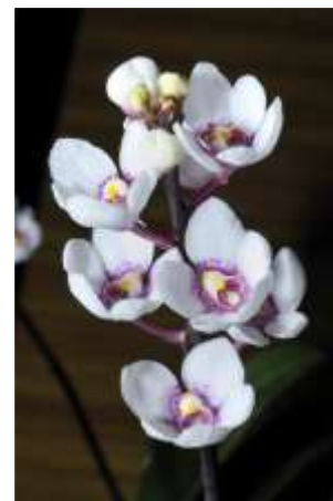
Sarc Wandjina 'Cheerful' x hartmannii 'Perfection'