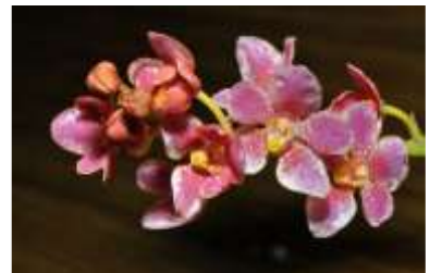
Sarc Dove 'Good' x Karla 'Red'